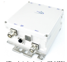
*The photo is showing MI-14301