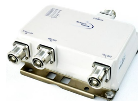
*This photo is showing MI-23301