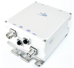
*This photo is showing MI-12756