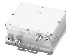
*This photo is showing MI-17336