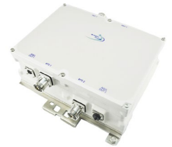
*This photo is showing MI-15801