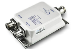
*This photo is showing MI-25401

The MI-254nn family of cavity diplexer products include: